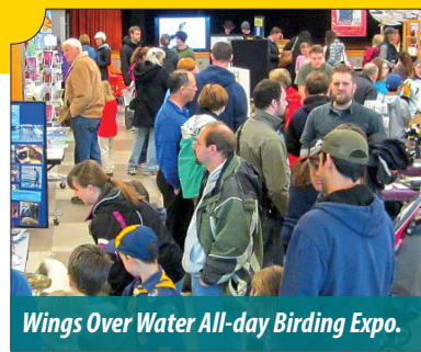
Wings Over Water All-day Birding Expo.