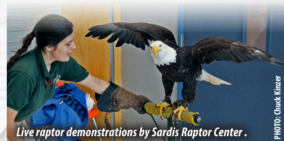
Live raptor demonstrations by Sardis Raptor Center.

eBird Whatcom County Hotspots bitly.com/whatcom-ebird