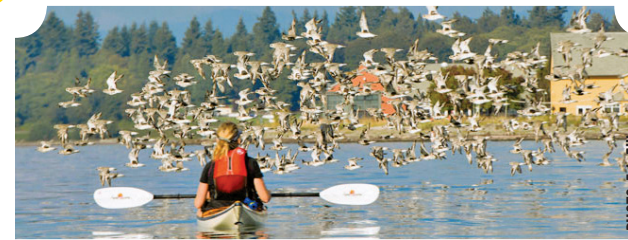
Kayaking the shoreline by Semiahmoo Resort-Golf-Spa in Blaine.